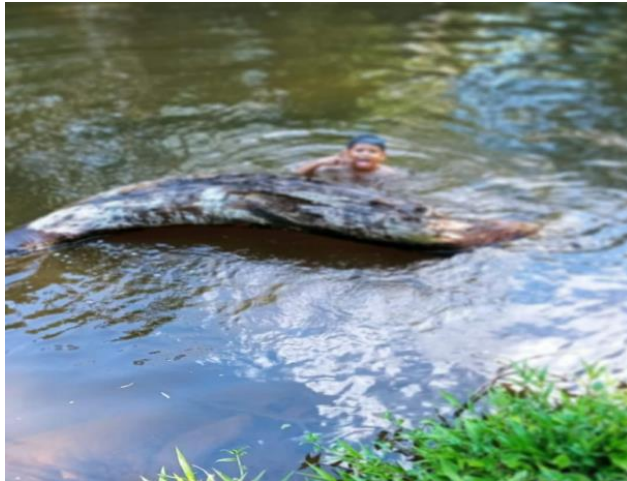
Rio Tarumã - December de 2020